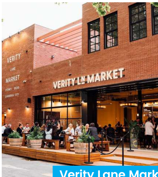
Verity Lane Market

Rizla, Bar Rochford, Parlour, Molly, The Highball Express